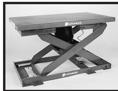
EZU-15 with standard 30" x 51" top