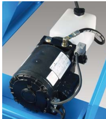
Unitized pump, motor and reservoir combination for dependable operation