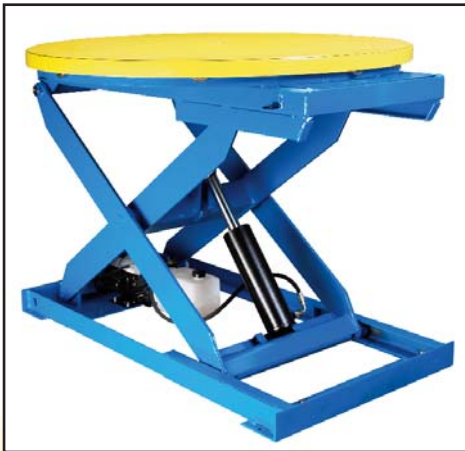
Shown with optional integral turntable top

The Lift2K & Lift25K Scissor Lift Tables are the best value 2000 & 2500 lbs. capacity lifts on the market today. They are designed to increase productivity and reduce worker strain in today's harsh industrial environments. By lifting and accurately positioning the load, the Lift-2K and Lift-25K lift tables eliminate excess lifting and stretching that ultimately leads to worker fatigue injuries and possible product damage. No matter how you compare it, the Lift-2K and Lift-25K lift more for less.