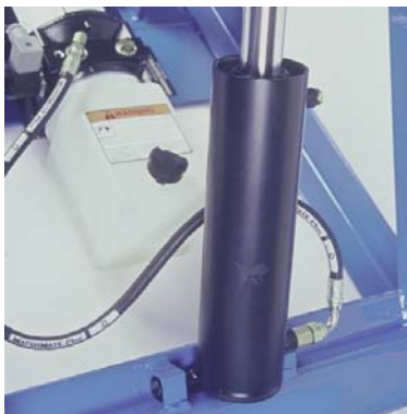
Single acting cylinder with flow limiting valve provides safe, low pressure operation