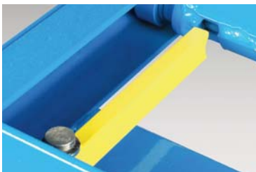
Hinged maintenance bars for convenience and added safety